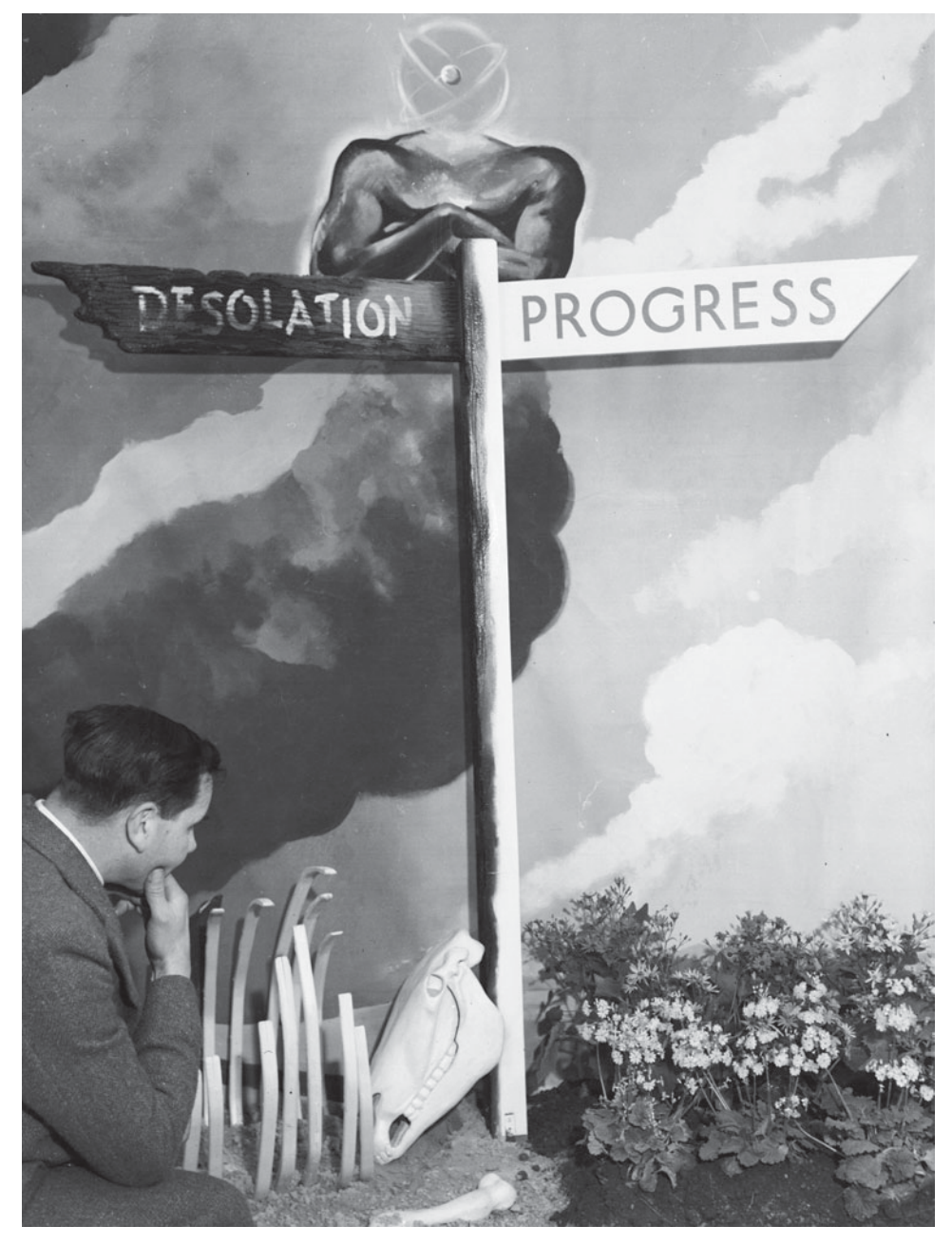
Figure 1. A flowering garden represents 'Progress' in an exhibition at Dorland Hall, London, depicting the two potential roads of atomic energy. The exhibition, part of the 'Atom Train', was the first to present atomic energy to the public and was sponsored by the British Atomic Scientists Association. 'A choice of future', 23 January 1947.